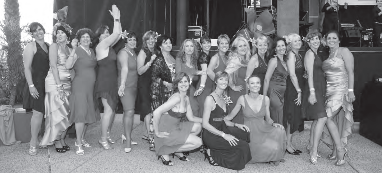
The Ladies of Makua